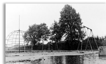
Play equipment in Chemistry Pits - 1987

The Chemistry Pits land was gifted to the children of Upton by Sir John Frost of Upton Lawn, who was Mayor of Chester from 1913 to 1919. Village children had played on some of his land up to the point when it was lost in the 1930s, as part of the building of the A41.